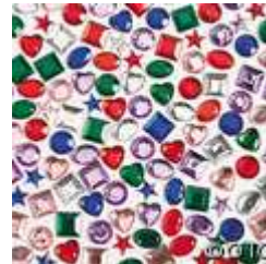
Hearts • Assorted Sizes & Colors • Smiley Heart Faces • Red & White Lace